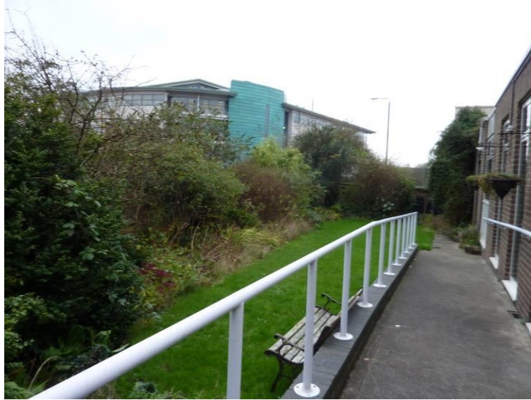
Figure 1. The rear of the building showing the ramp and the surviving fragment of the burial ground

Repairs took place in 2001-2 when the roof of the older part of the building was refurbished, insulation was installed and thermal curtains fitted. The work was undertaken by Blair Gratton Architects. A major refurbishment of the extension took place in 2004-6 when the ramp was added, new windows were put in and other works undertaken. This work was undertaken by Anthony Short & Partners.