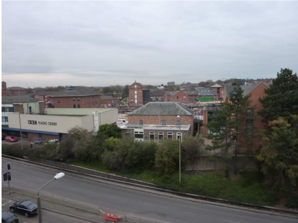
Figure 3. The meeting house (centre) and its setting